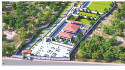
administration to relocate the facility in respect of the sentiments expressed by people.

The site earmarked for the construction of an all-faith environmentally friendly crematorium, burial ground-cemetery in the Navghar area of Bhayandar (east) is all set to be shifted after a massive public uproar by local residents opposing the facility amidst a densely populated residential locality.