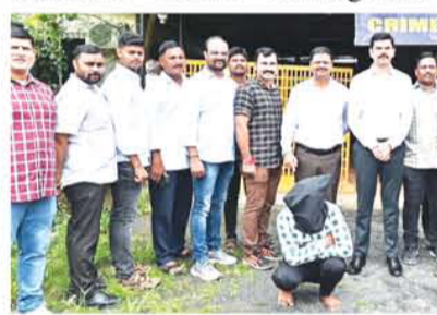
and learnt about Shamshera's involvement in the crime, following which informers were alerted and an electronic surveillance system was activated. It came to light that Shamshera had fled to Varanasi after committing the crime.

Less than a week after he fled the state after brutally murdering a 52-year-old building contractor in Nallasopara, the accused was arrested by the crime branch unit (Zone III) attached to the Mira Bhayandar-Vasai Virar (MBVV) police from a remote village near Varanasi in Uttar Pradesh.